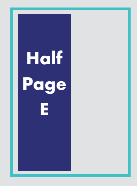
E: Half Page Vertical 95mm (w) x 246mm (h)