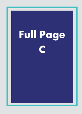
C: Full Page 190mm (w) x 277mm (h)