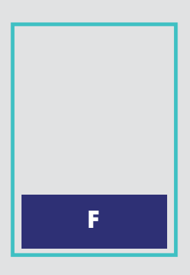
F: Quarter Page Horizontal 190mm (w) x 61.5mm (h)