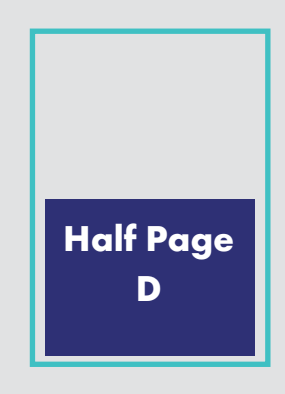
D: Half Page Horizontal 190mm (w) x 128mm (h)