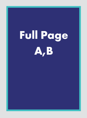
A: Outside Back Cover B: Inside Front Cover 210mm (w) x 297mm (h)